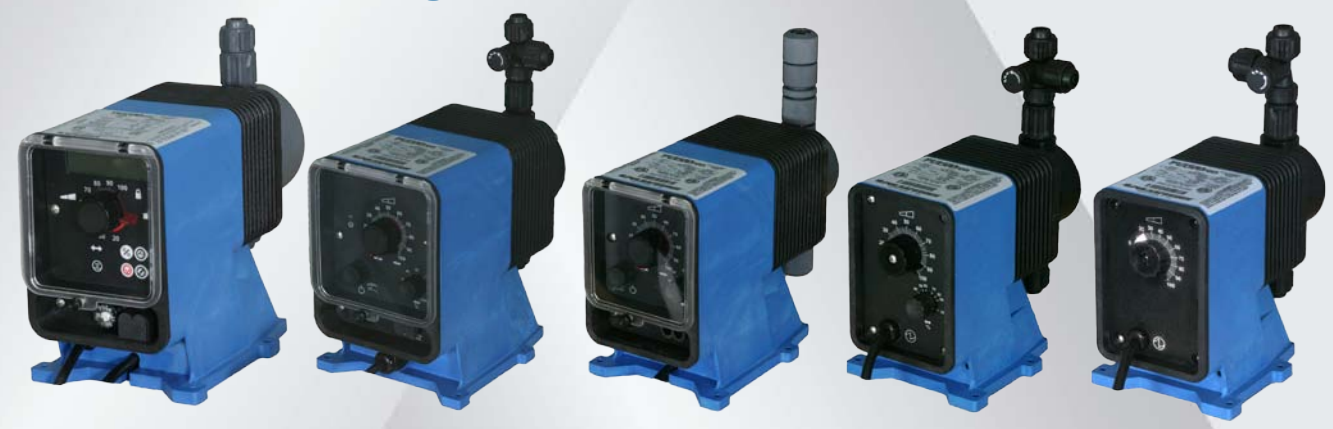
The Pulsatron is available in several different series. Shown here are the Pulsatron MP Series, E Plus Series, HV Series, A Plus, and C Series.